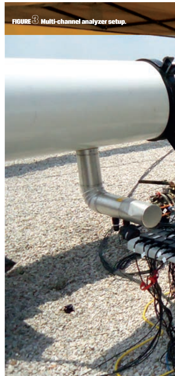
FIGURE 3 Multi-channel analyzer setup.